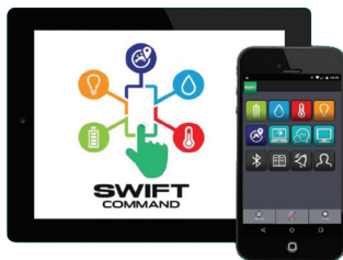
Swift Command allows remote control of habitation systems via a Smartphone or tablet.

Earlier in the year a member asked about Swift Command and expressed concern that as he couldn't operate a computer he wouldn't be able to operate the habitation systems in his new motorhome, if he bought one so equipped. Recently I attended a seminar on this so I'm up-to-speed now. Let it be made crystal clear that you don't need to be a computer whizz to operate it and it is there for you to take advantage of – or not – as you see fit. It is an additional control system and doesn't affect manual operation of (say) the awning light. Everything can still be controlled manually via a switch on the control panel or by using the temperature control on the fridge in the same way you always have.