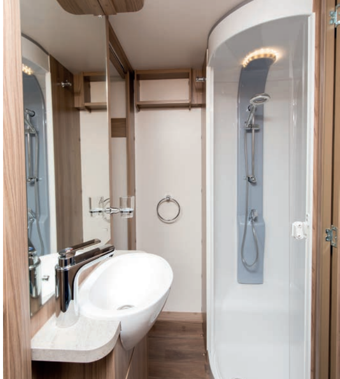
LEFT-RIGHT The washroom's vanity unit provides a basin, mixer tap and narrow worktop, while the shower wraps around the wheelarch

The kitchen has just two overhead cupboards, a narrow cutlery drawer and a narrow cupboard below; we reckon you'll need the dresser opposite for provisions. Cupboards take care of toiletries in the washroom, but spare towels may have to go in the bottom of the wardrobe.