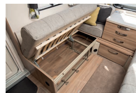
CLOCKWISE FROM RIGHT The well-equipped kitchen has an extension flap for extra space; sofa bases provide storage and a second bed, with slats pulled out from the centre chest