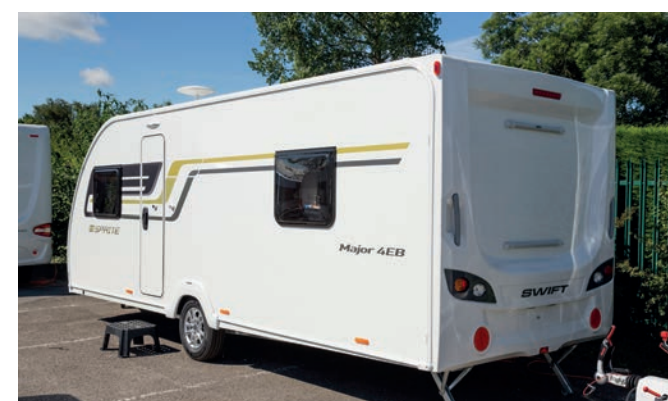
The Sprite's exterior is uncluttered and streamlined, with minimal linear graphics winding around and over the caravan's darkened windows

The interior scheme is medium-toned cabinetwork with oatmeal-grey tweed furnishings, given a lift with lemony-lime and charcoal-grey scatter cushions (part of the Diamond Pack) and '50s-inspired curtains with lime, grey and black leaf motifs on an off-white background. It's fun, pleasing and not too controversial, but you can also opt for the French Grey and gold 'Albion' soft furnishings for £195. The seat backs are plump and straight, and the base cushions are thick and comfortable.