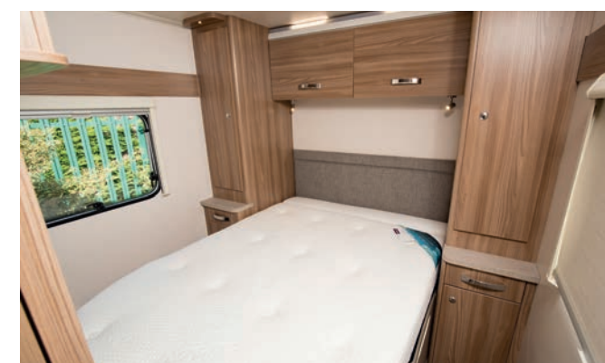
Usually associated with upmarket models, the central island bed, with its grey headboard, fills the space between rear wall and washroom