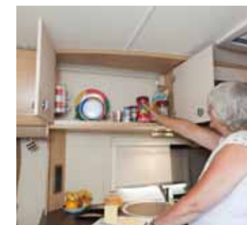
ALL AND SUNDRY The cupboard above the kitchen unit is a very versatile space, but the doors are a bit of a head-bump hazard when open