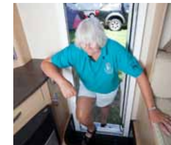
BIG STEP UP The standard-height chassis results in two high steps up to the habitation, which might cause problems for some