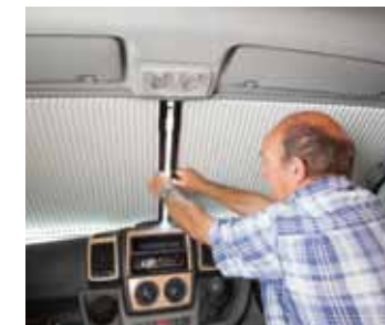
BUILT-IN BLINDS Cassette cab blinds are standard-issue on the Bessacarr, although our testers did find that they rattled a bit on the road