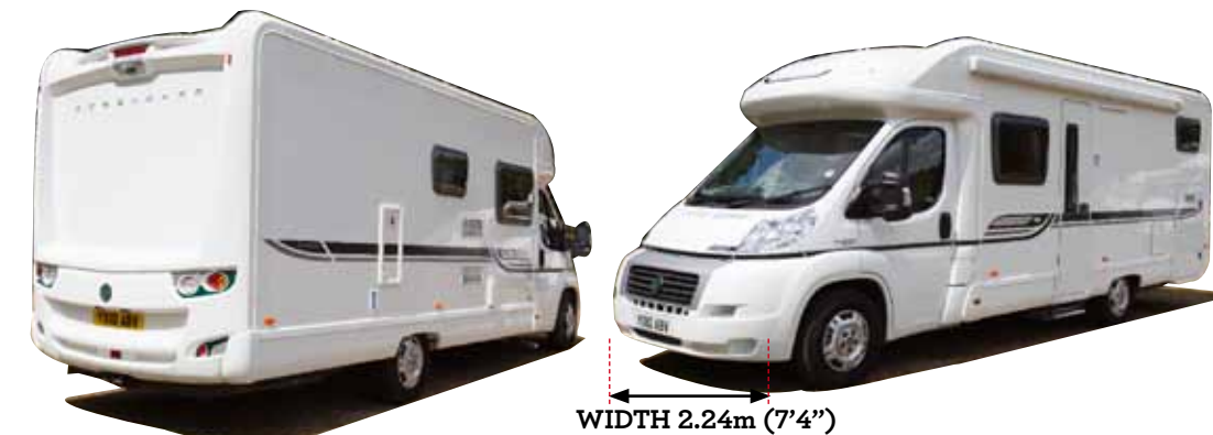
WIDTH 2.24m (7'4")