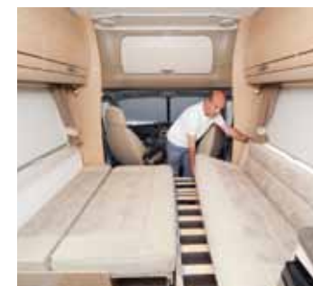
GUEST ROOM The facing-sofa lounge lends itself well to the creation of a spacious double bed, for guests – it's easy to set up and very comfortable