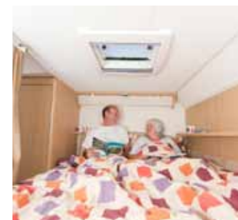
RESTING PLACE The area around the large rear transverse bed has been thoughtfully designed, and includes ample shelving and lighting