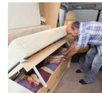
NEAT SEAT Both of the sofas in the lounge offer storage space under their lift-up bases, and the space under the nearside sofa is particularly generous