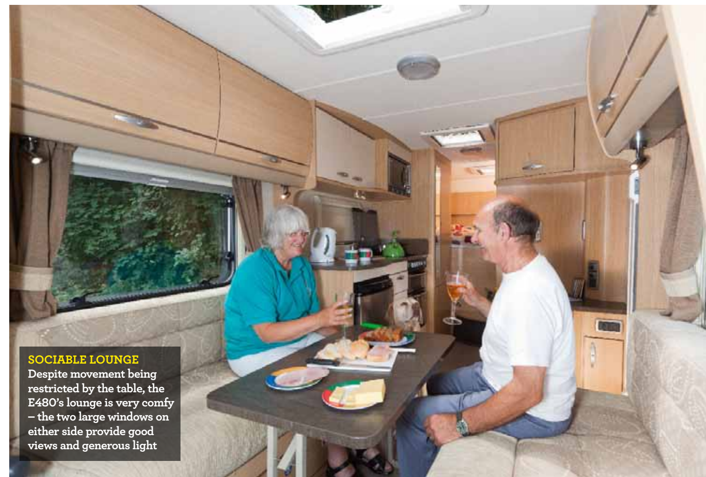
SOCIABLE LOUNGE Despite movement being restricted by the table, the E480's lounge is very comfy – the two large windows on either side provide good views and generous light