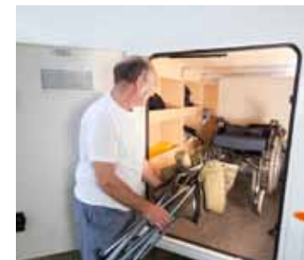
LOTS OF ROOM OUT BACK The big garage is made more useful thanks to the E480's high payload – but the long overhang means rear axle weights might be an issue