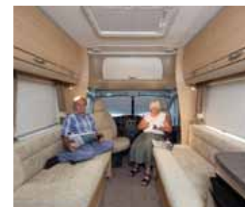
SPACE TO STRETCH OUT The table has to be stowed in order to clear sufficient space to lounge in comfort – leaving you with no space to rest mugs and so forth