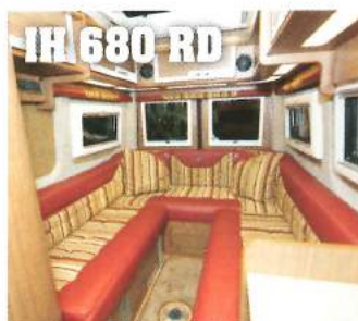
IH 680 RD