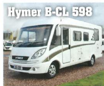
Hymer B-CL 598