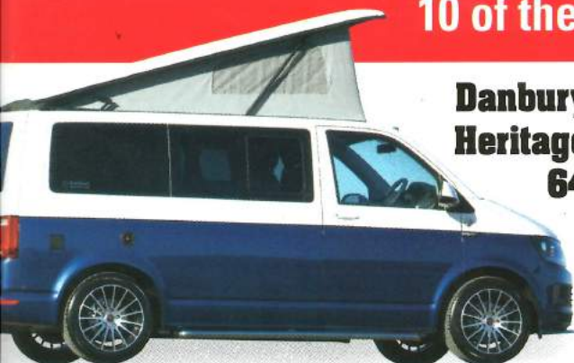
Danbury Heritage 64

10 of the very latest campervans and motorhomes