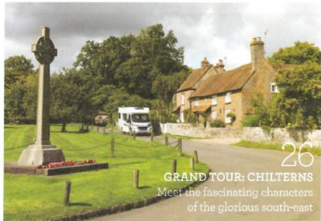
26 GRAND TOUR: CHILTERN Meet the fascinating characters of the glorious south-east