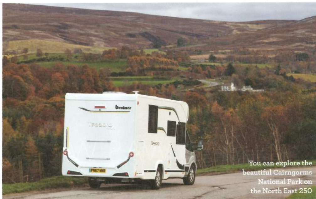
You can explore the beautiful Cairngorms National Park on the North East 250