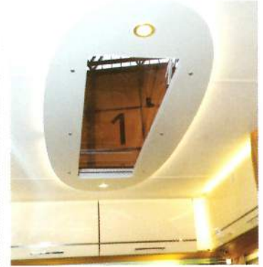
The Saros skylight is long, and set into a light-surrounded panel

The first of three special editions of the Lunar Clubman range has been unveiled. These limited edition models, called Saros, with high spec and wow-factor styling, are launched to celebrate 40 years of the Clubman marque.