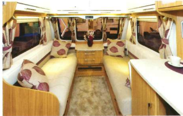
Clubman Saros Edition lockers have high-gloss cream doors