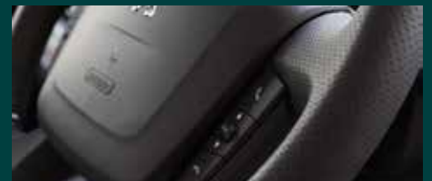
Bluetooth® Connectivity & Steering Wheel Controls